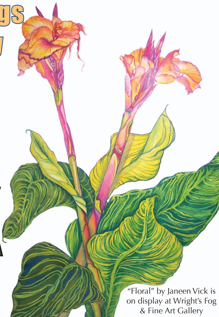
"Floral" by Janeen Vick is on display at Wright's Fog & Fine Art Gallery